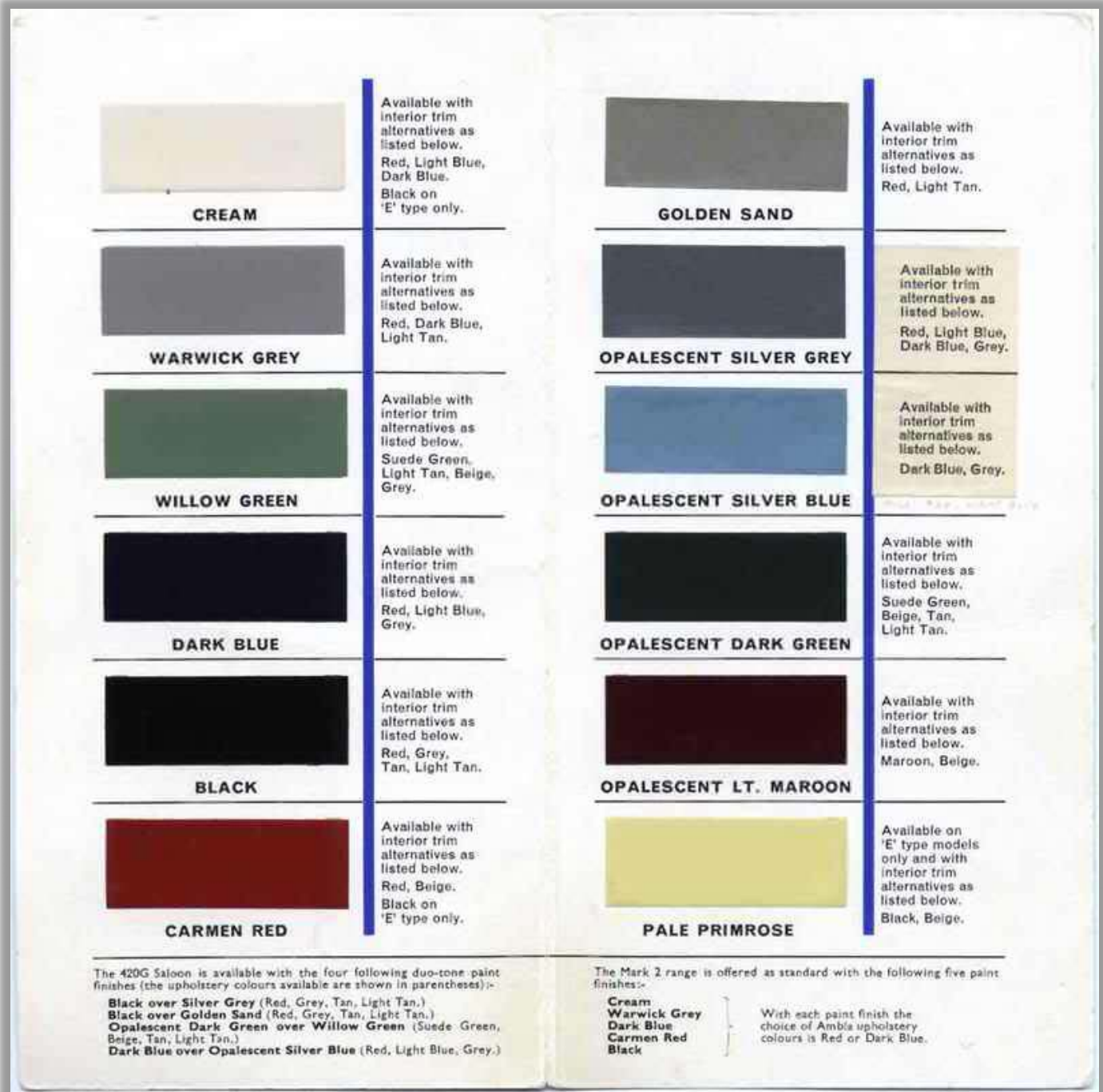
Jaguar Color Chart

Note: Jaguar Heritage Certificate is considered authentic information and supersedes Jaguar color charts.