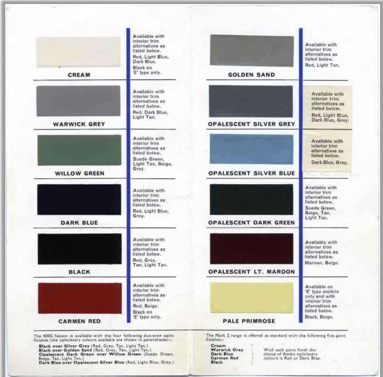
Jaguar Color Chart from Brochure

Note: Jaguar Heritage Certificate is considered authentic information and supersedes Jaguar color charts.