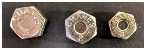
CRANES used elsewhere but not on the subframe

Three examples of each bolt are shown because the bolt heads are slightly different for each of the three examples per manufacturer.